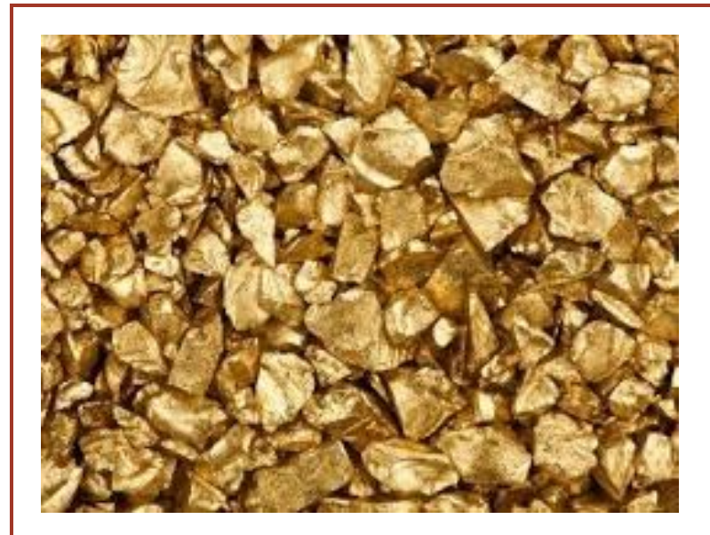
NITOC NUGGET, Thursday